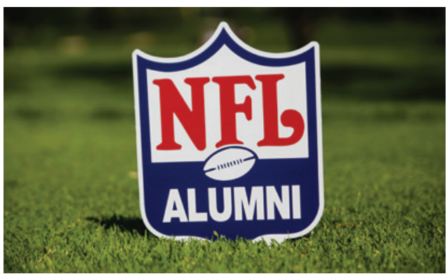
Gateway was also selected as the beneficiary for the NFLA Atlanta Chapter golf outing on Friday, November 3, 2017. We are thankful for our continued partnership!